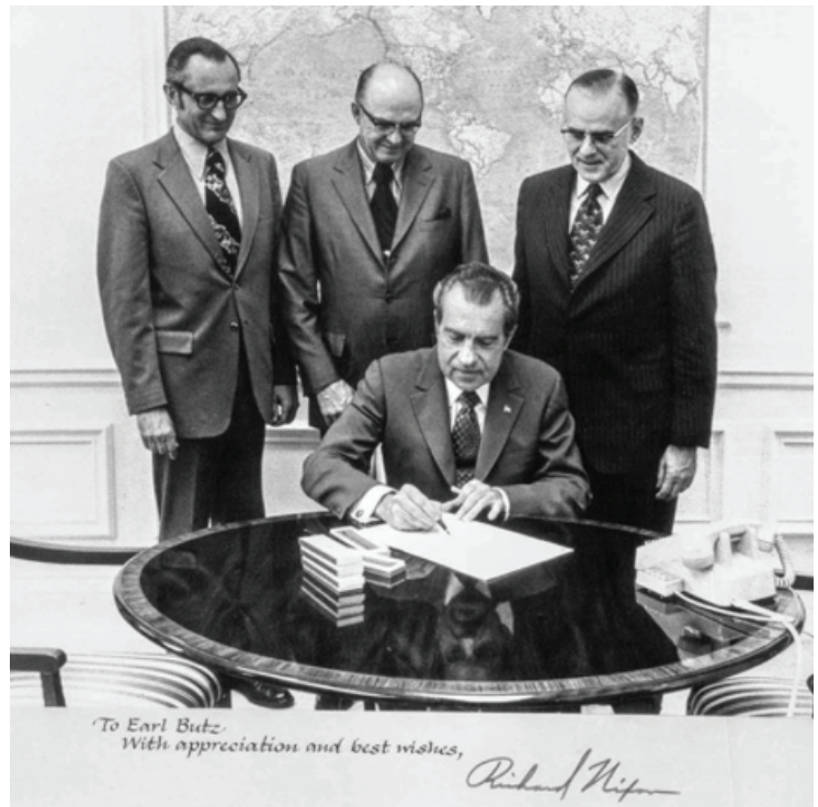
President Richard Nixon signing the Rural Development Act on August 30, 1972.